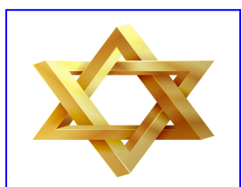
Bar Mitzvah בר מצווה

(bar MITS-vah), which is a noun, means a son (bar) of the commandment; a man of duty. Normally at the age of 13, the Jewish boy reaches maturity and is obligated to observe the commandments. The Bar Mitzvah ceremony formally marks the assumption of that obligation, along with the corresponding right to take part in leading services, to count in a minyan (the minimum number of people needed to perform certain parts of the religious services), and more.